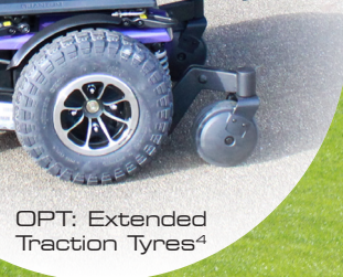
OPT: Extended Traction Tyres 4