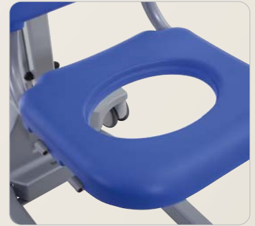
7 Seat area with large, lockable hygiene opening.