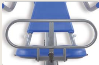
8 Optional: Side rail for plugging into a bracket at the seat with safety lock.