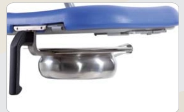
9 Optional: Bedpan support for inserting your in-house bedpan.