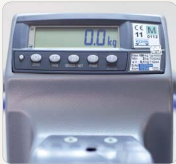
5 Optional: Digital patient scale, calibrated.