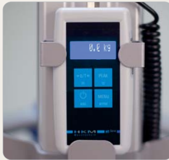
6 Optional: Digital patient scale, not calibrated.