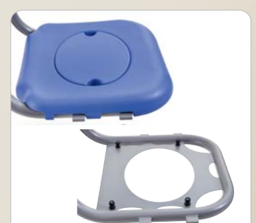
11 The PUR padding is easily slid onto the stainless steel frame and can be removed at any time.