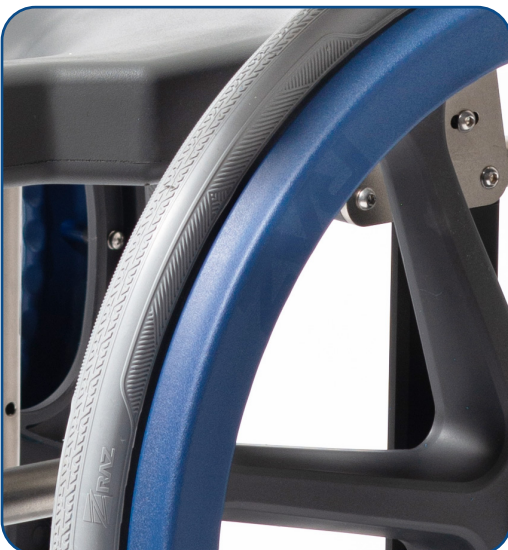
Ergonomic Handrim with thumb groove and finger notches