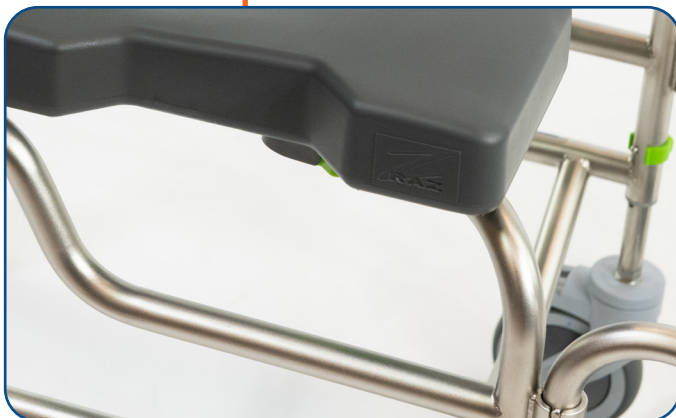
Unrestricted Side Access

Recessed, dipped front cross tube allows for better toilet bowl access and facilitates standing-pivot transfers