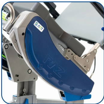
Patented, Dual-Arc Tilt Geometry

Maintains a near-constant location of the center of mass (CoM), which greatly reduces tilt effort.