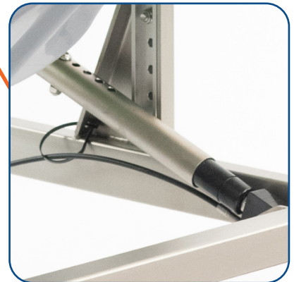
Pressurized Gas Struts