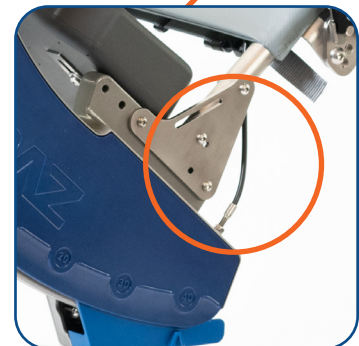
Innovative Cable Management System