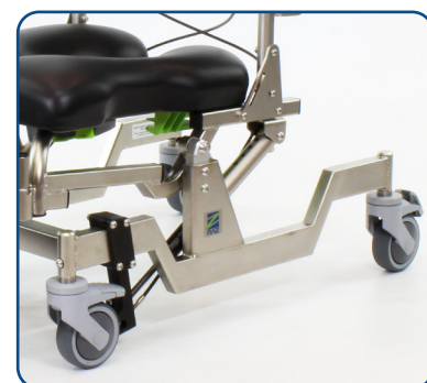
Super-Low AT (5" lower)