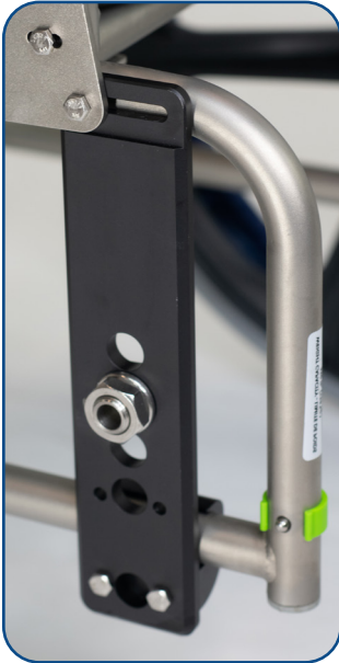
Adjustable Axle Plate