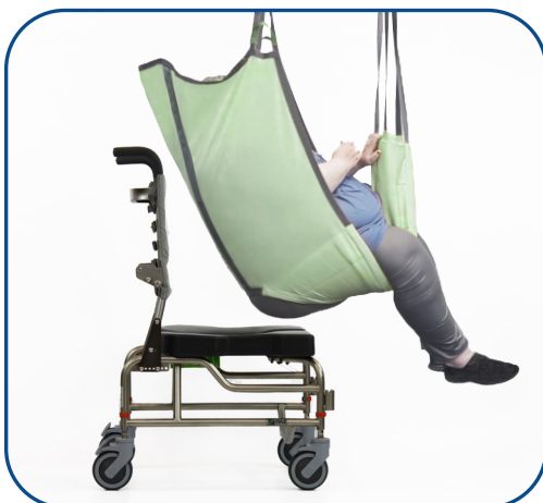
Transferring Into a Non-Tilting Chair