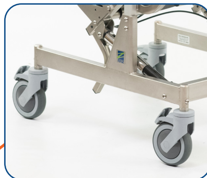
3" shorter base frame length vs. Raz-AT