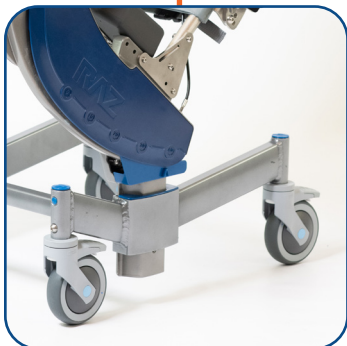
Invertible Base – Low Range (20"-23")