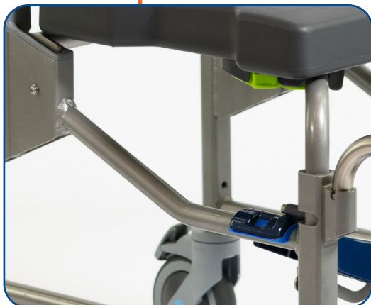
Unrestricted Side Access

Designed with a forward arch and low pivot point to allow the Züm to be positioned fully over a toilet