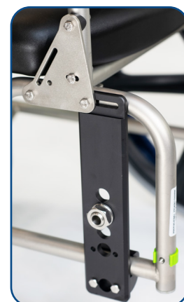
SP Axle Plate

Our design philosophy centers around the principle of modularity. Raz MSCCs can be configured to accommodate the client's medical condition and functional needs.