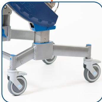
Invertible Base – High Range (24"-27")