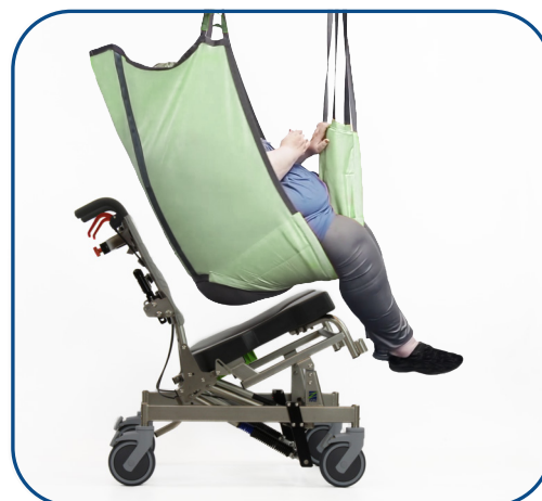
Transferring Into a Raz-AT600

The tilting feature of the Raz-AT600 allows for safer transfers when using a mechanical lift. The image above left shows a transfer into a non-tilting chair, which results in the client perched on the front edge of the seat. This is a potentially dangerous situation that can be avoided by using a pre-tilted AT600. Also, having the client on a tilted seat facilitates repositioning.