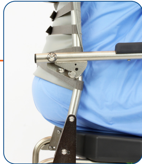
Gluteal Shelf Accommodation

Lower bend in back canes and tension-adjustable upholstery are standard on all Raz bariatric chairs.