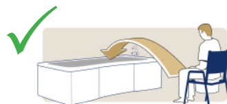
Transfer to Bath