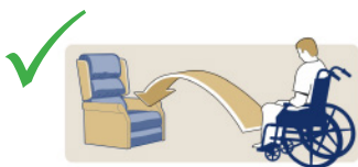
Chair to Chair