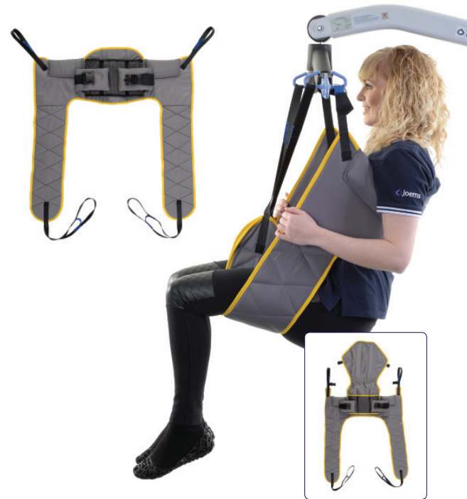
WITH HEAD SUPPORT