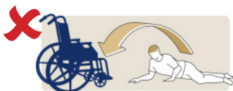
Floor to Bed/Chair