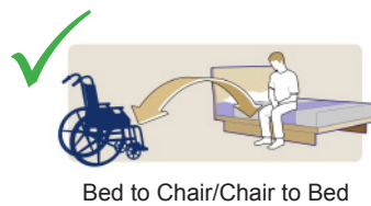
Bed to Chair/Chair to Bed