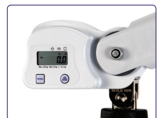
Digital weigh-scale (Class III)