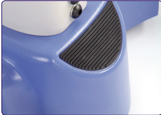
Foot 'push pad' helps reduce the force needed to initiate forward movement.