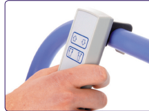
Hand control clip ensures convenient storage when not in use.