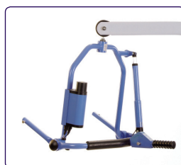
Manual or powered 4-point cradles