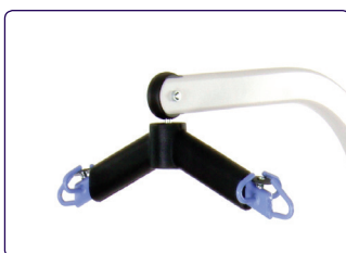
6-point spreader bar

The Stature can also be fitted with an optional digital weigh-scale device to aid patient monitoring. This Class III certified weigh-scale is extremely compact and has a dual screen display for ease of use.