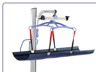
6-point adjustment cradle for use with a stretcher