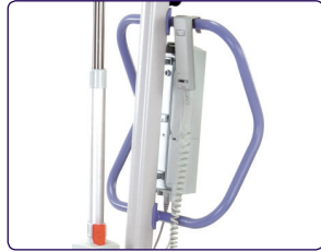
Over-sized push handle for improved handling and manoeuvrability.