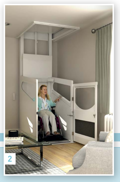
A simple push of the button sends the lift up. The controls can be positioned to suit your needs.