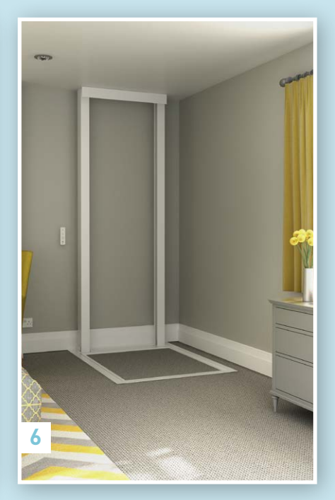
The lift can be sent back to the floor below, leaving a feeling of space in the room.