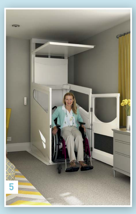
Low car construction ensures easy wheelchair access and egress.