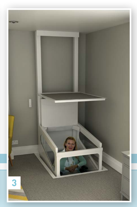
The aperture ceiling panel is automatically lifted or replaced en-route.