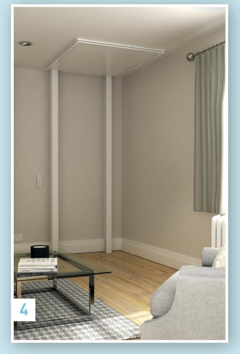
The lift moves to the other floor and vacates the space it was in.