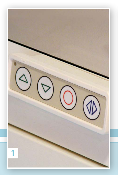
Easy-to-use wireless controls come as standard in the car and at both floors.