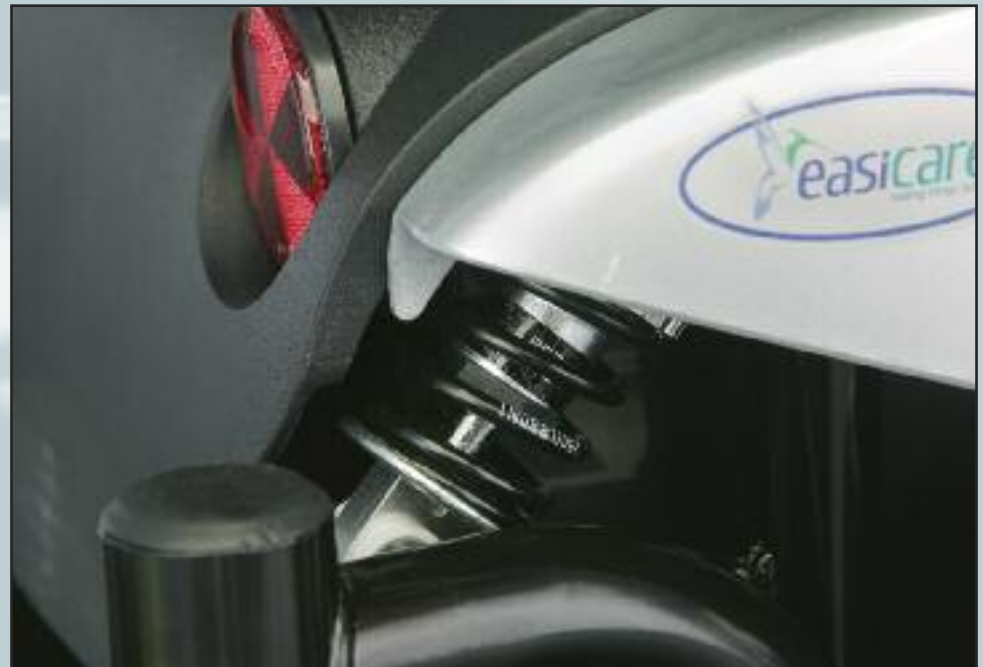
Full coil-over suspension system