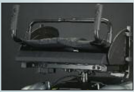
Backrest folds for ease of storage