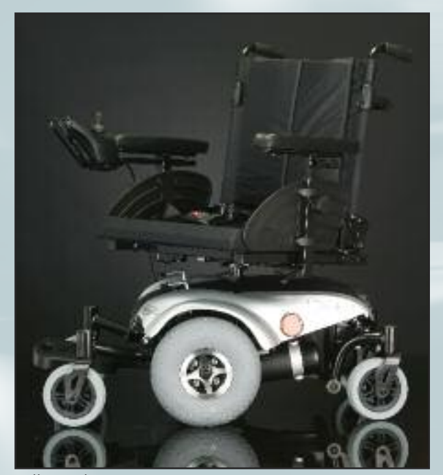
Full swivel seat system