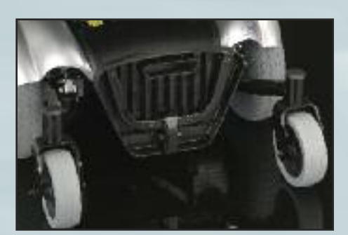
Footrest in the upright position

Inherent modular adjustability is included in the design specification resulting in easy and quick to adjust settings to accommodate different user needs.