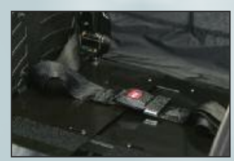
Positioning belt as standard