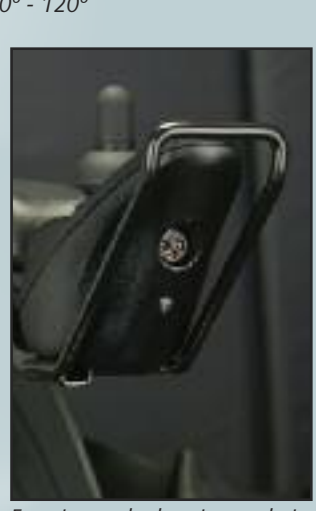
Easy to reach charging socket