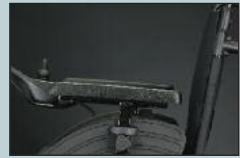
Height adjustable armrest