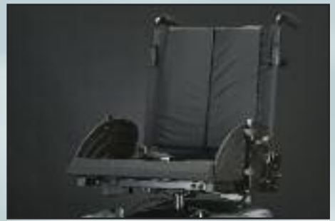
Armrests detach for ease of transfer