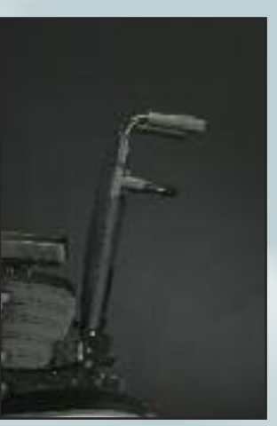
Adjustable backrest angle from 100° - 120°