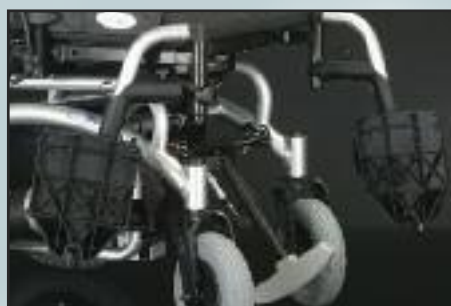
Fold-up and swing-away footrests

Inherent adjustability is included in the design specification resulting in easy and quick to adjust settings to accommodate different user needs.