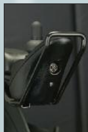
Easy to reach charging socket