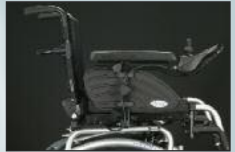
Adjustable tilt positioning