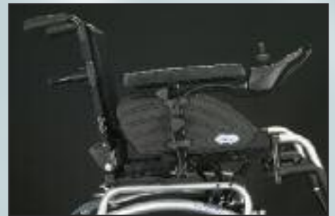
Additional tilt adjust