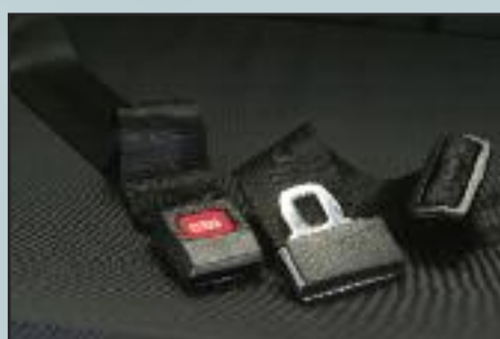
Positioning belt as standard