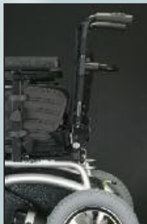
Adjustable backrest as standard