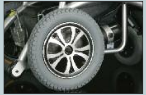
13" Alloy rear wheels