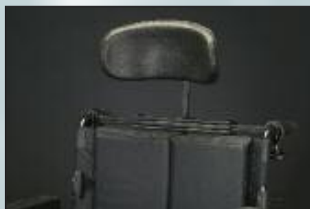
Head rest (Optional)