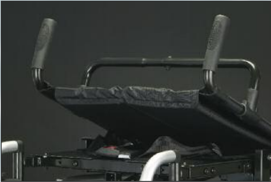
Fully folding back