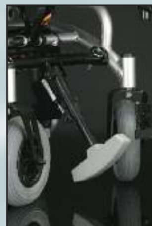
Kerb climber (Optional)