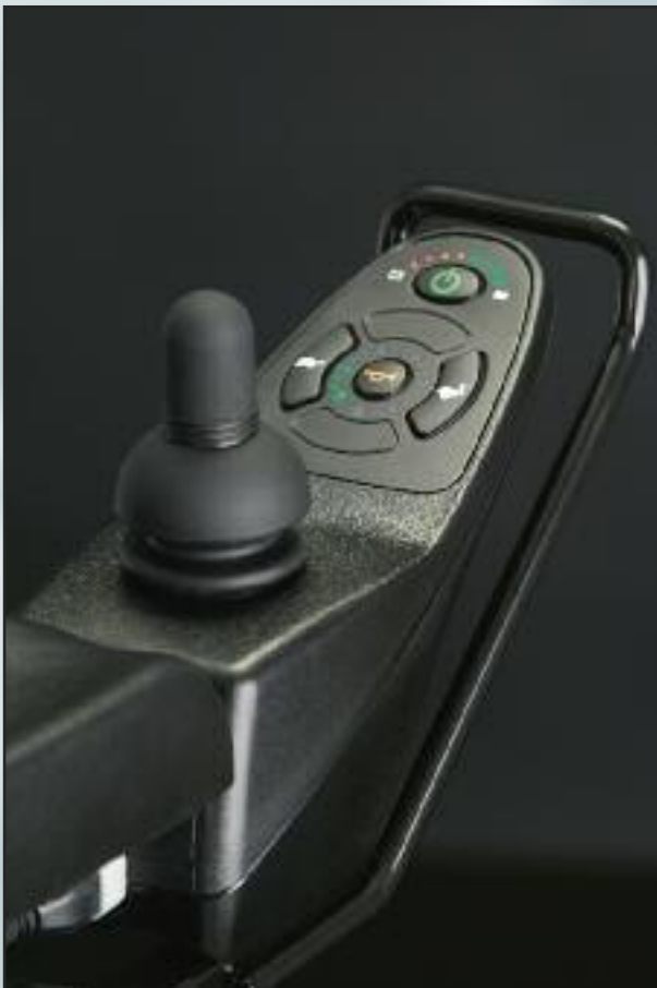
Dynamics Electronic Control System as standard