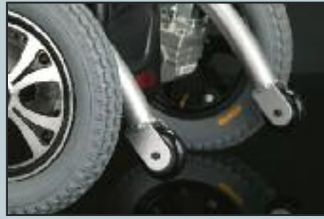
Anti tip wheels fitted for safety