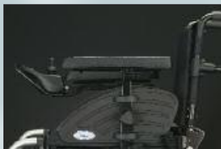
Height adjustable armrests