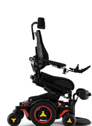
Anterior tilt adjustment