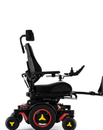
Leg rest adjustment