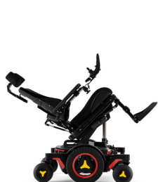
Posterior tilt adjustment