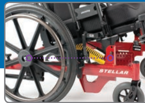
Easily adjustable axle position