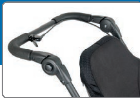
Adjustable push bar option