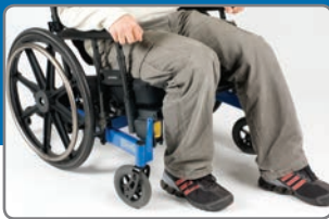
Ideal for foot propulsion

Nine standard frame colors to choose from and custom colors also available. Contact us for details.