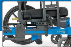
Adjustable seat height, seat depth, back angle and rear wheel