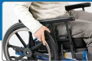
Ideal for hand propulsion