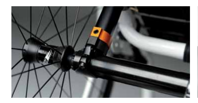
Rigid axle assembly with height adjustment. Oval shapes, forged parts, wider clamps and 'cathodic coating' ensure extreme rigidity, silence and allows +/-1 cm fine tuning of rear seat height.