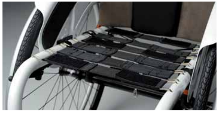
Innovative clip upholstery, combined with lighter seating and back materials. This option provides the minimal solution for adjustable seating, is elasticated for profiling and still allows easy centre of gravity adjustment.