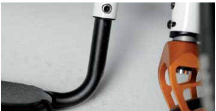
Light, infinitely height adjustable foot-plates: Platform, performance, tubular and hi mount foot-plate options are infinitely adjustable by two hidden screws for low weight and style. No clamps needed.