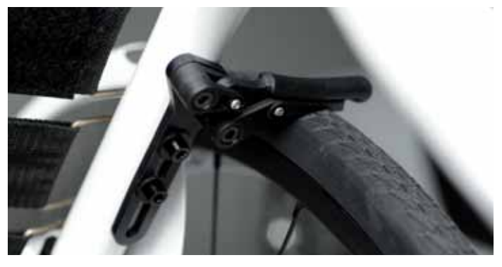
Ergonomic compact wheel locks. Minimalist, easy to lock. Can be screwed direct to the frame (on 0 and 3 degree wheel camber only). Also suitable for 'quads'. (Option)