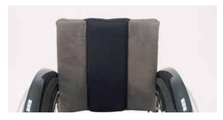
Innovative back upholstery Range. Choose Electron upholstery to save 300 g or opt for the 'three piece' vented or 'Alcantara' comfort upholsteries. These can be velcro – width adjusted for more 'curve' whilst ensuring the backposts remain well covered. Patented insert sections for positioning foam or Jay Spine Align inserts. Breathable, adjustable, comfortable and very stylish!