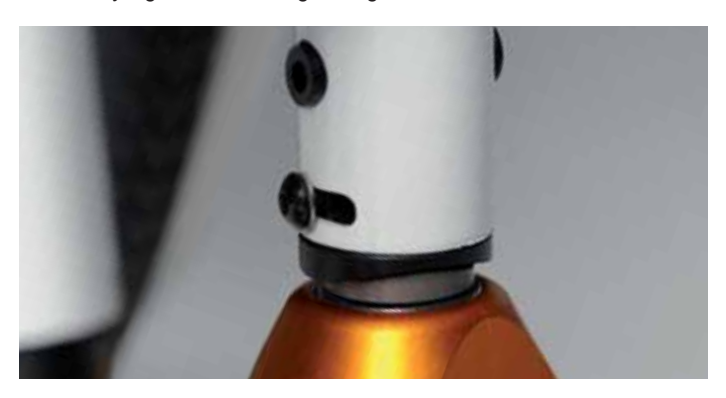
Invisible castor fork adjustment. A patented mechanism that hides the fork angle adjustment inside the castor tube. Easy adjustment, less materials and smooth styling!