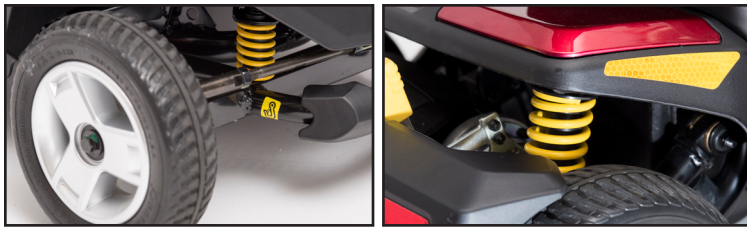
CTS Front and Rear Suspension