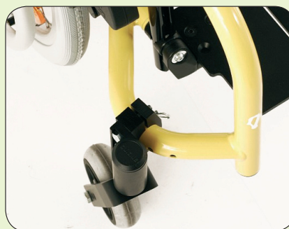
Outriggered frame option for increased stability.