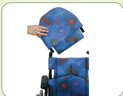
Optional Squiggle upholstery and transit approved removable domed headrest.