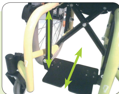
Adjustable legrests provide 6" of depth and 9" of height adjustment. No dead spots - infinite adjustment.