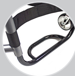
Height adjustable footrest and velcro calf strap