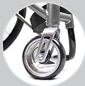
Welded castor housing with aluminium cap and welded castor fork