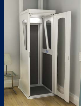
Vivendi Home Lift