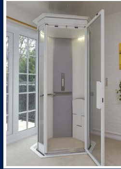
Lifestyle Home Lift

For further information or to book your free home survey, call MMS Medical today on 021 4618000 or visit www.mmsmedical.ie to view our full range of home lifts