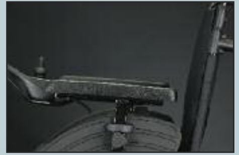
Height adjustable armrest