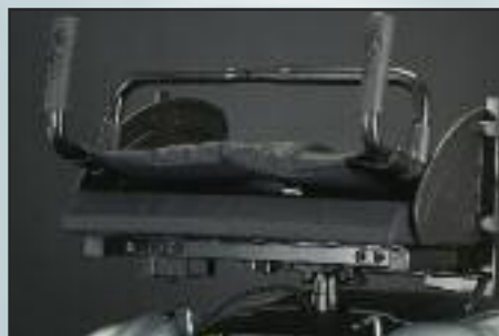
Backrest folds for ease of storage