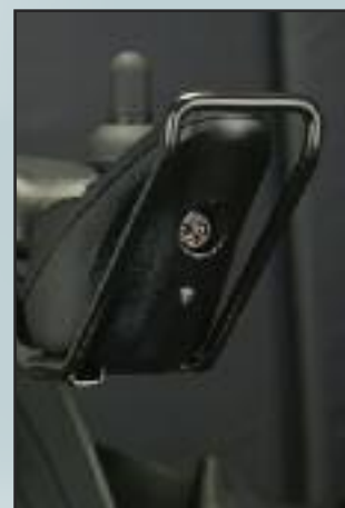
Easy to reach charging socket