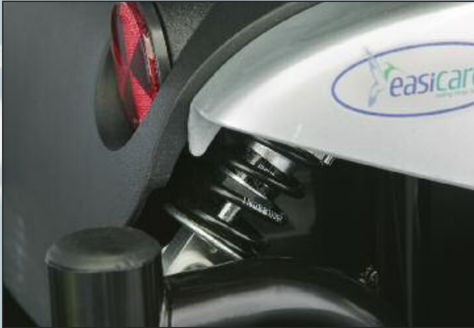
Full coil-over suspension system