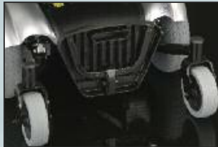
Footrest in the upright position

Inherent modular adjustability is included in the design specification resulting in easy and quick to adjust settings to accommodate different user needs.