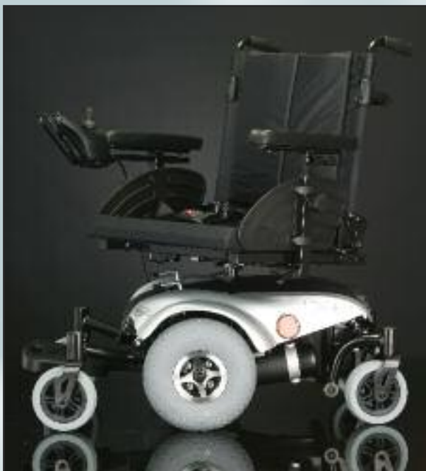
Full swivel seat system