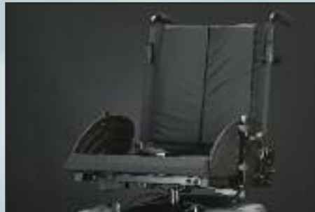
Armrests detach for ease of transfer