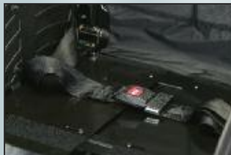
Positioning belt as standard