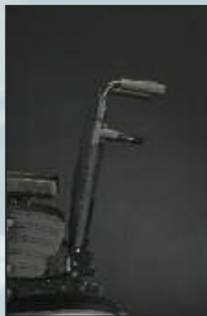
Adjustable backrest angle from 100° - 120°