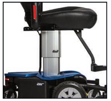
10" Seat lift, which can be operated at 3.5 Mph