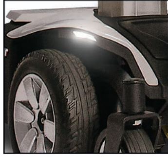
Bright LED marker lights