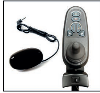
VR2 drive control with LED marker switch & Buddy button for 10" seat lift