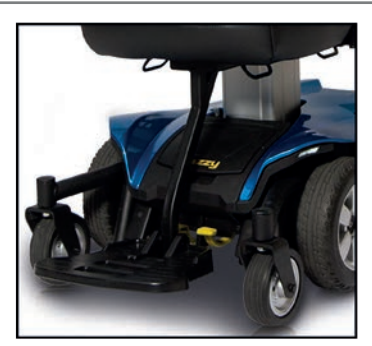
Integrated footplate and footplate design