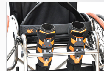
► RGK knee support system