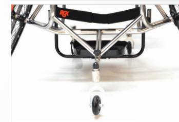
► Length adjustable anti-tip

If you're ready to be measured up and order your Grand Slam chair call MMS Medical on 01 4618000 for a free consultation .