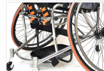
► Titanium frame option